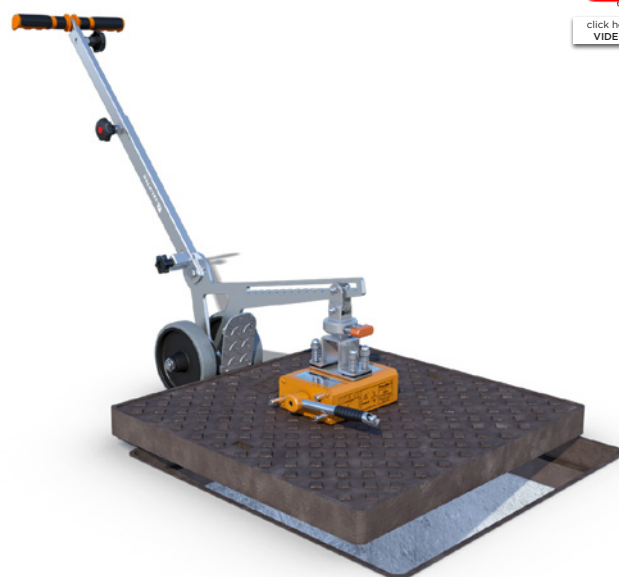
Simplex Magnetic manhole cover opener